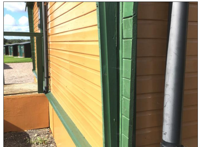
Kitchen corner repaired and painted