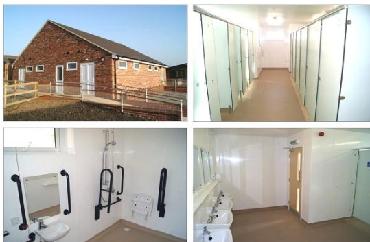
New toilet and shower building